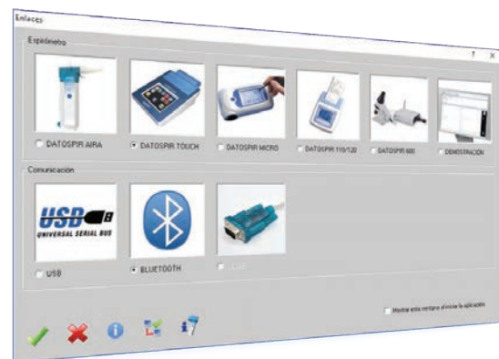
Compatible with all Sibelmed spirometers